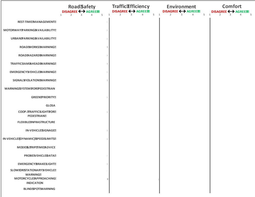
Figure 1 - Responses regarding the societal value of C-ITS services

ranging from Strongly Disagree to Strongly Agree. The results are presented in Figure 1.